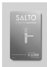
Key Card NXP MIFARE®