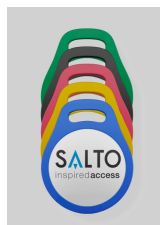
Key Fob NXP MIFARE®