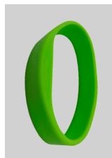
Silicone Wristband NXP MIFARE®